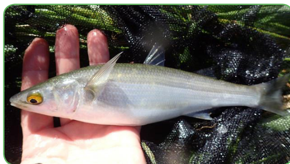
Yelloweye mullet

Macroinvertebrate ID chart (best for early/primary years).