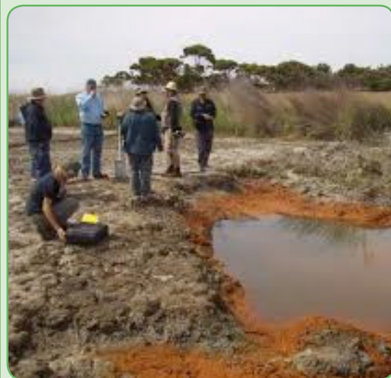
Inspecting an area affected by acid sulfate soils

When water levels in the Lower Lakes reached unprecedented lows during the Millennium Drought, more than 20,000 hectares of acid sulfate soils became exposed. The consequences to local communities included decreased water quality, health issues for people and livestock, dust storms, sulfuric odours, ecological degradation and fish kills.