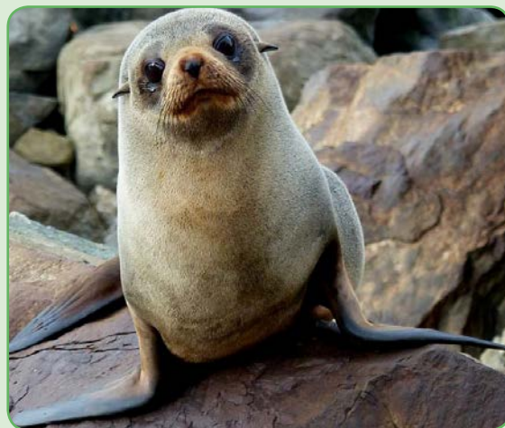
Long-nosed fur seal (By Bernard Spragg. NZ from Christchurch, New Zealand)