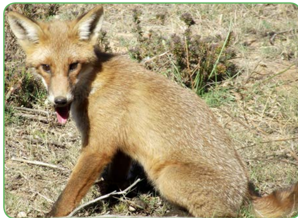
Foxes have a significant impact on ground nesting birds such as hooded plovers.

Conduct a habitat assessment and then take steps to improve habitat e.g. make and install nesting boxes.