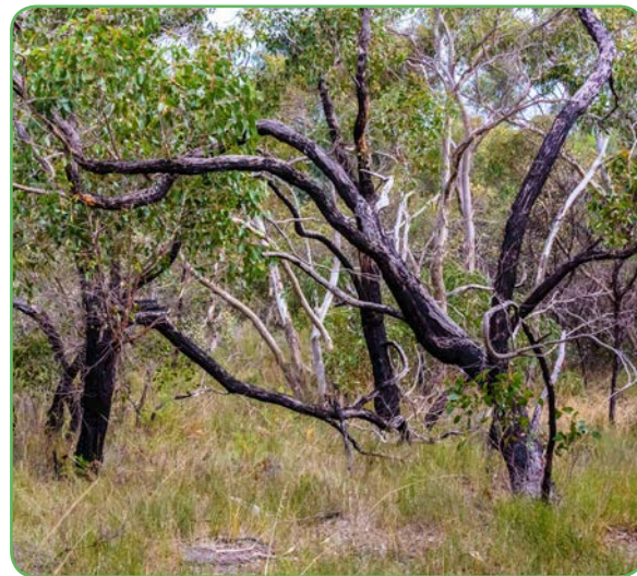
Vegetation after a prescribed burn

The Our Coorong, Our Coast project includes developing a fire program for controlling invasive shrubs in sedge lands in the southern Coorong.