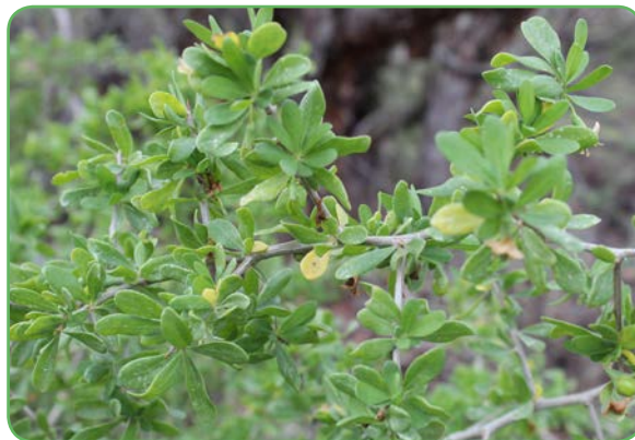
African boxthorn provides a haven for feral animals.