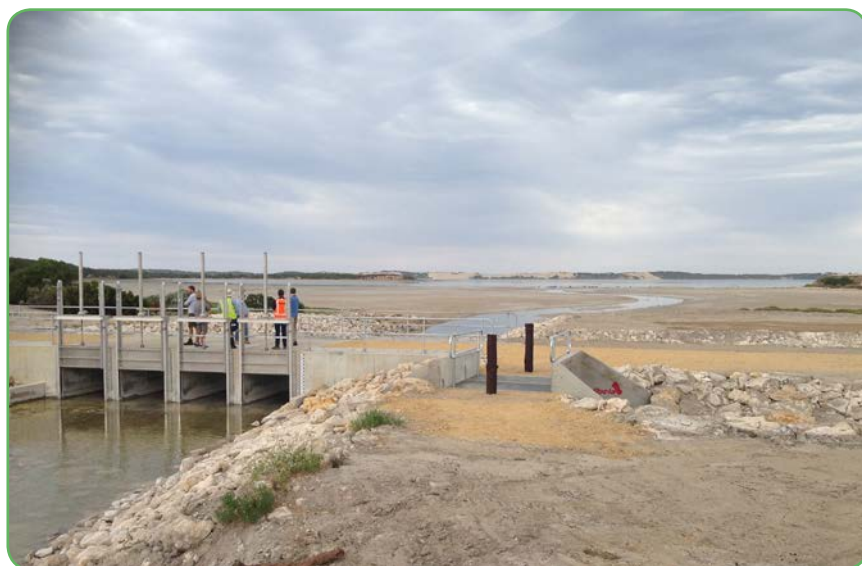
A structure and fishway have been constructed to join the South East drainage system to the Coorong's South Lagoon at Salt Creek.